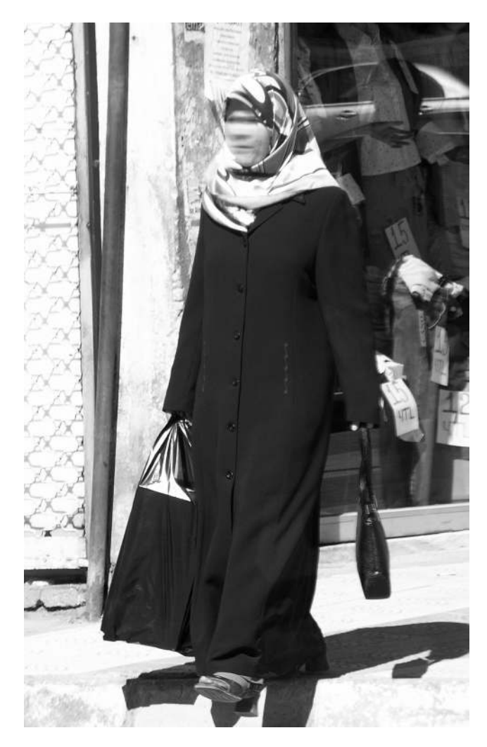
Note.—Color version available as an online enhancement.

1980s TESETTÜR: LARGE HEAD SCARF AND LONG, LOOSE OVERCOAT