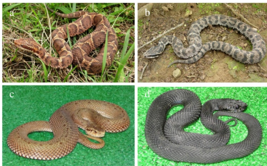
Figure 1 Color variation in mamushi. (a) Common color; (b, c) color variations; (d) melanistic variant.

Several enzymes, including a protease, phospholipase A2 (PLA2), and bradykinin-releasing-enzyme are contained in the mamushi venom [16]. The effects of these enzymes are described in Table 1. Local pain and swelling are the main symptoms at the bite site; subcutaneous bleeding and blisters are sometimes observed. The swelling and pain spread gradually from the bite site