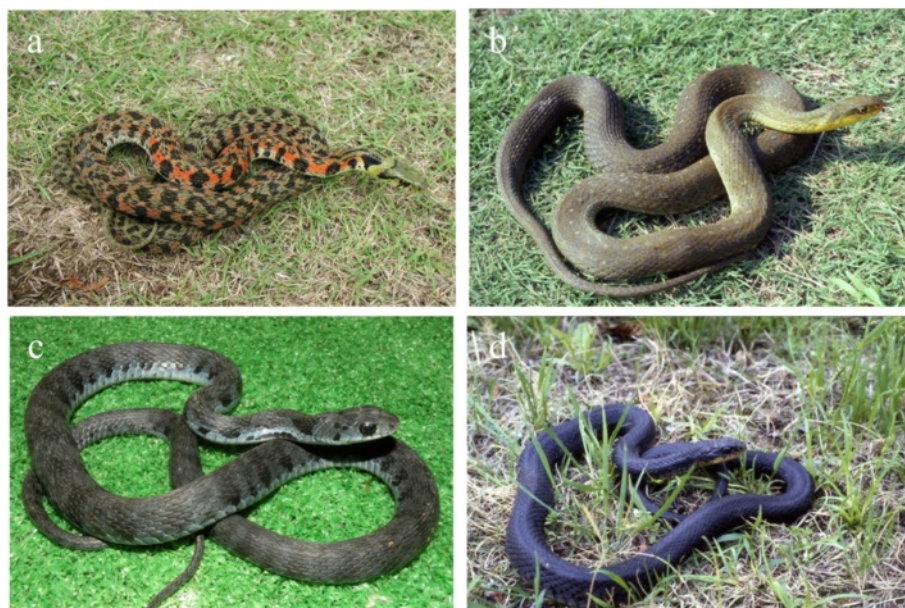
Figure 4 Color variation in yamakagashi from different geographical locations. Yamakagashi from (a) Kanto and Tohoku; (b) Chubu and Kinki; and (c) Chugoku and Sikoku; (d) melanistic variant.

As the venom is absorbed from the bite site, the platelet count gradually decreases due to the platelet aggregation activity of the venom, sometimes decreasing to <100,000/\text{mm}^3 [21]. Cases in which the platelet count rapidly