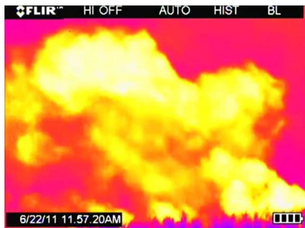
Fig. 1 Venting of natural gas into the atmosphere at the time of well completion and flowback following hydraulic fracturing of a well in Susquehanna County, PA, on June 22, 2011. Note that this gas is being vented, not flared or burned, and the color of the image is to enhance the IR image of this methane-tuned FLIR imagery. The full video of this event is available at http://www.psehealthyenergy.org/resources/view/198782 .

Cathles et al. state with regard to our paper: “The data they cite to support their contention that fugitive methane emissions from unconventional gas production is [sic] significantly greater than that from conventional gas production are actually estimates of gas emissions that were captured for sale. The authors implicitly assume that capture (or even flaring) is rare, and that the gas captured in the references they cite is normally vented directly into the atmosphere.” We did indeed use data on captured gas as a surrogate for vented emissions, similar to such interpretation by EPA (2010). Although most flowback gas appears to be vented and not captured (EPA 2011b), we are aware of no data on the rate of venting, and industry apparently does not usually measure or estimate the gas that is vented during flowback. Our assumption (and that of EPA 2010) is that the rate of gas flow is the same during flowback, whether vented or captured. Most of the data we used were reported to the EPA as part of their “green completions” program, and they provide some of the very few publicly available quantitative estimates of methane flows at the time of flowback. Note that the estimates we published in Howarth et al. (2011) for emissions at the time of well completion for shale gas could be reduced by 15%, to account for the estimated average percentage of gas that is not vented but