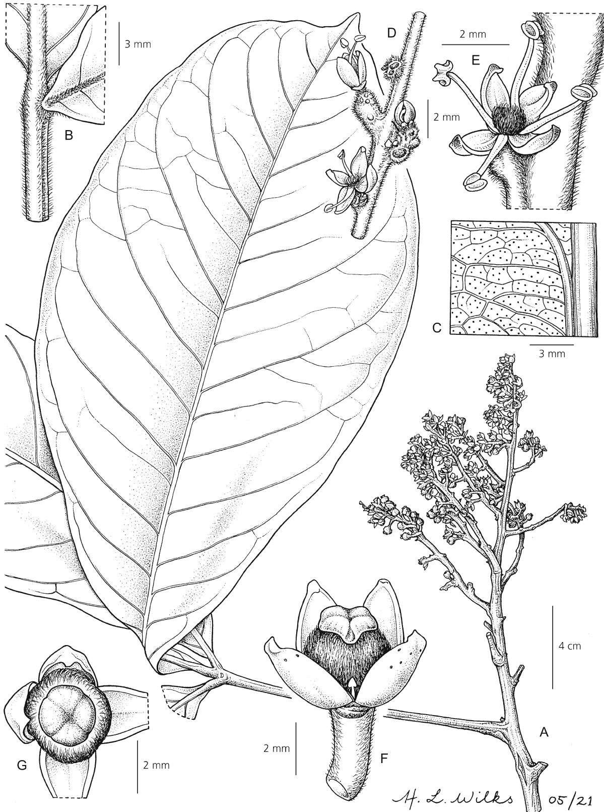
Fig. 1. Vepris onanae . A habit, flowering stem with female inflorescence; B base of leaflets and indumentum; C gland dots on abaxial leaf surface; D portion of male partial inflorescence; E male flower, showing sessile attachment; F female flower, side view, showing vestigial stamen and oil glands; G female flower, top view, with two petals pulled back. A – C, F & G from Onana 2006, D & E from Zapfack 2039. DRAWN BY HAZEL WILKS.