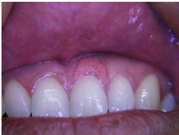
Fig. 1. Verrucous plaque in anterior gingival

Patient white, male, aged 38 years-old, underwent dental treatment due to the presence of a verrucous plaque (Fig.1) of approximately 10 mm x 6 mm, located in anterior gingiva, which presented as asymptomatic, with slow, gradual growth evolving over 4 years.