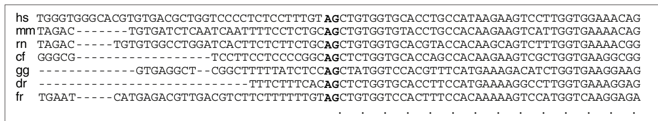
Figure 1 Alignment for a coding splice acceptor site. The figure shows the central part of a typical alignment window used by the classifier component of DOGFISH. Codon boundaries on the exon side of the splice site are indicated with dots. This site has an alignment with all species except frog: hs; Homo sapiens : mm; Mus musculus : rn; Rattus norvegicus : cf; Canis familiaris : gg; Gallus gallus : dr; Danio rerio : fr; Fugu rubripes . The AG dinucleotide for the acceptor site itself is shown in bold.