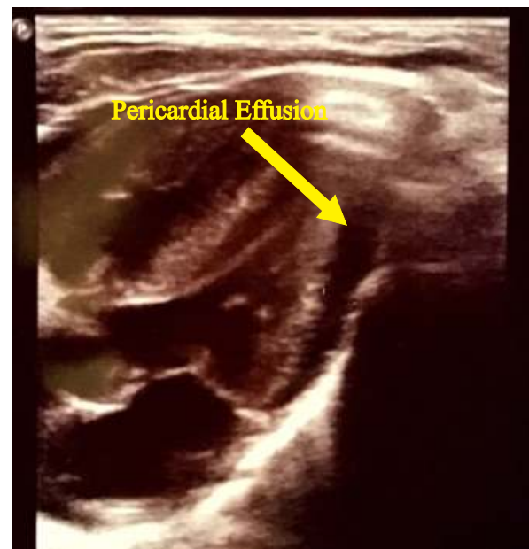
Figure 2: USS Thorax with evidence of pericardial effusion

Dengue antibodies were done on day 7 of life and showed dengue IgM positive with IgG negative. Mother's dengue IgG and IgM both were positive on day 9 of her illness.