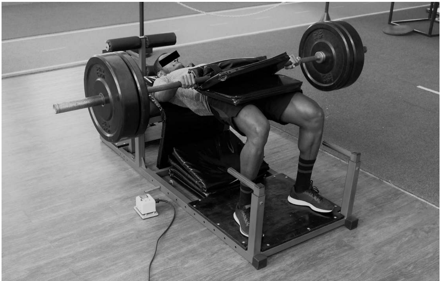
Fig 2. An Olympic sprinter performing a loaded hip-thrust at the optimum power zone.

Although small, the differences between the correlations presented by hip-thrust and vertical jumps in the maximum acceleration phase (i.e., from zero to 10-m) should be highlighted and considered as worthwhile outcomes ( Table 3 ). Indeed, in elite sprinting, trivial variances