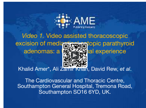
Figure 2 Video assisted thoracoscopic excision of mediastinal ectopic parathyroid adenomas: a UK regional experience (10).

Intravenous methylene blue (MB) at a dose of 0.5 mg/kg body weight in a 500 mL bag of 5% dextrose/saline was started intravenously at induction of anesthesia and finished just before exploration ( Figures 1,2 ) (10). MEPAs preferentially took up the dye and were made easily