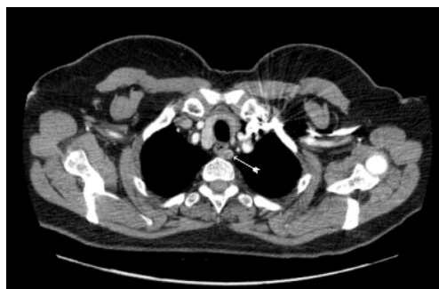
Figure 3 Superior mediastinal mediastinal ectopic parathyroid adenoma (MEPA) in a left para-esophageal location, at the level of vena cava, azygos vein, and higher than origin of left subclavian artery, approached successfully by cervical exploration.

Until recently, bilateral neck exploration was the gold standard operation for primary hyperparathyroidism, without localisation imaging. The Scholz-Purnell report from the Mayo Clinic in 1971 and the Kaiser report by Rubinoff in 1983 concluded that: “our recommendation for patients whose clinical and laboratory studies support the diagnosis of primary hyperparathyroidism has been and continues to be surgical exploration by an experienced parathyroid surgeon.” There is general agreement that an experienced parathyroid surgeon should perform a minimum of nine to ten explorations annually (16,17). Bilateral neck exploration aims at identifying all four parathyroid glands and removing all abnormal parathyroid tissue. Despite a high cure rate approaching 70%, neck exploration is related to failure, morbidities and difficult second surgeries, not to mention the large unsightly incision. Edis et al. suggested that the main reason for failed exploration is “failure on the part of the surgeon to appreciate the nuances and variations of normal parathyroid anatomy” (18). This trend is retracting, as precise preoperative localisation studies and intraoperative PTH monitoring coupled with the advent of keyhole surgery (VATS) have managed to improve cure