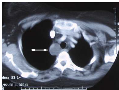
Figure 4 Superior mediastinal ectopic parathyroid adenoma (MEPA) in a right para-tracheal location, supra-azygos, approached successfully by triportal video-assisted thoracoscopic surgery (VATS).

thoracic surgeon expert in VATS mediastinal surgery is recommended. Roughly, MEPAs higher than the right innominate artery or the origin of the left subclavian artery are likely to be accessible by a cervical approach ( Figure 3 ). However, it is to be emphasized that there is little evidence to support this generalisation. Wheeler et al. (Cardiff-1988) described the challenges of the middle mediastinal parathyroid adenomas (20). The three cases described in their series would have been the domain of VATS nowadays without the need for open sternotomy ( Figure 4 ).