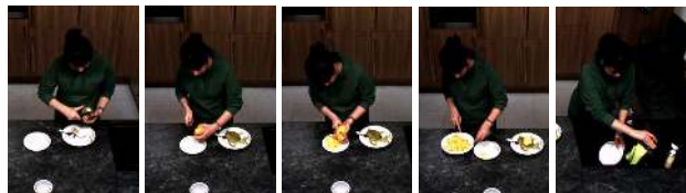
The person peeled the fruit. The person put the fruit in the bowl. The person sliced the orange. The person put the pieces in the plate. The person rinsed the plate in the sink.