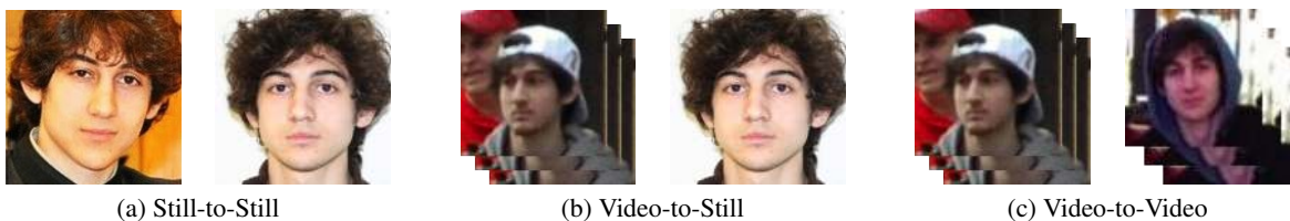
Figure 1. Face recognition can generally be categorized into one of the following three scenarios based on the characteristics of the image(s) to be matched. (a) Still-to-still image matching is perhaps the most common scenario and is used in both constrained and unconstrained applications. (b) Video-to-still image matching occurs when a sequence of video frames is matched against a database of still images ( e.g. , mug shots or driver license photos). (c) Video-to-video matching, or re-identification, is performed to find all occurrences of a subject within a collection of video data. Re-identification is generally a necessary pre-processing step before video-to-still image matching can be performed. In this work, we generate a baseline accuracy using commercial face matchers for video-to-video face matching.

in an attempt to identify the subject (Fig. 1b).