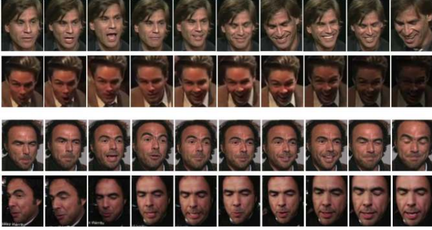
Figure 2. Example images from face tracks of two subjects. Top two and bottom two rows are face tracks from the same subject.

A face track can be represented as a set of images, U = \{u_1, u_2, \dots, u_a\} , where u_i is the i -th face detected/extracted from a consecutive frames of a video. Given two face tracks U and V , each containing a and b faces, respectively, we can apply any static-image face matcher to all frame-to-frame pairs (u_i, v_j) to obtain a \times b similarity scores s(u_i, v_j) . Hence, the comparison of two face tracks results in a similarity matrix S(U, V) . Under the assumption that each face track contains faces of a single person, we wish to recognize if two face tracks represent the same identity. Whether for face identification or face verification, the track similarity matrix needs to be resolved to a single similarity score indicating the overall similarity between the two identities present in the two face tracks.