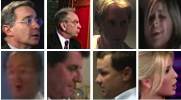
Figure 5. Example images from eight face tracks in the YTF database where all images in that track could not be enrolled by one of the COTS matchers. These images display extreme pose and illumination conditions, low resolution, and motion blur.