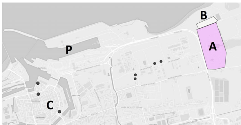
Figure 2: Map of the Calais Camp as it stood during the research period A = Informal New Calais camp or “new jungle”; B = Formal accommodation for 200 women and children; C = Centre of Calais; P = Port area for ferries to the UK; ● = Sites of forcibly cleared encampments [Colour figure can be viewed at wileyonlinelibrary.com ]

In recent years camps have been the landscapes of significant political change and revolution. The barricaded battleground of the Maidan in Ukraine, for example, which helped overthrow President Yanukovich (Phillips 2014), or the events in Egypt’s Tahrir Square where the “camp defeated the dictator” (Ramadan 2013b). While the geopolitical importance of these spaces has been made clear (Minca 2005), as well as their potential to be everyday sites of political resistance and urban experimentation (Katz 2016; Sigona 2015), the informal refugee camp within the EU has increasingly become a space of stagnation and a symptom of political failure.