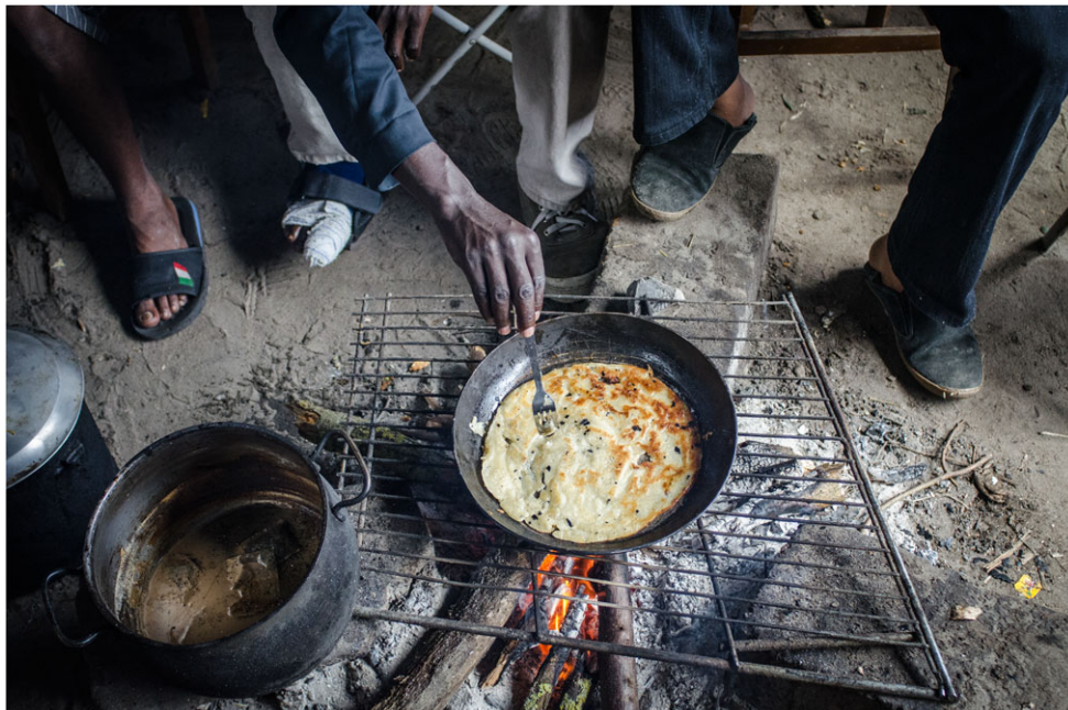
Figure 4: A refugee with an injured foot cooking in a makeshift kitchen inside the “new Jungle”; due to a lack of facilities for clean water and washing facilities, pathogenic bacteria was found in this and other makeshift spaces (see Dhési et al. 2015) [Colour figure can be viewed at wileyonlinelibrary.com ]

The violence that refugees are exposed to in the camp has impacts across different scales, including at the microbiological level, thus highlighting what Farmer (1996:5) calls the “pathogenic roles of social inequalities”. Interviews with residents