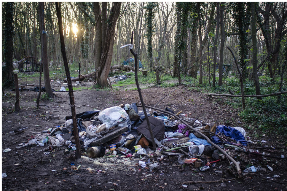
Figure 3: A former squatter camp near Calais, forcibly cleared by police in April 2015 [Colour figure can be viewed at wileyonlinelibrary.com ]