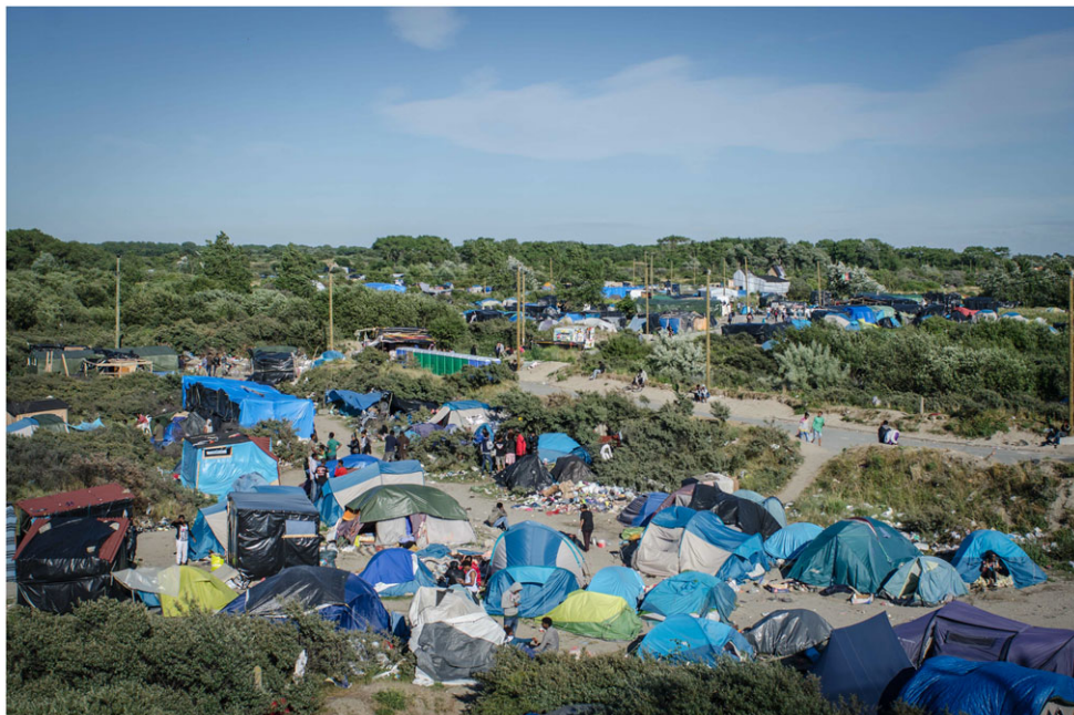
Figure 6: A view of the tents and makeshift structures in the western part of the Calais camp [Colour figure can be viewed at wileyonlinelibrary.com ]

reported their conditions worsening over time by damp and cold conditions, whilst all residents interviewed reported being extremely cold, especially during the night. This permanent wounding of refugees would not be as grievous if it was for a short period, but some residents had been exposed to such conditions for up to a year, articulating how they felt “trapped”. As security around the port town increased in the summer of 2015, the possibility of reaching the UK was reduced and the camp was increasingly seen as a temporary home, with refugees having built makeshift educational, community and religious spaces.