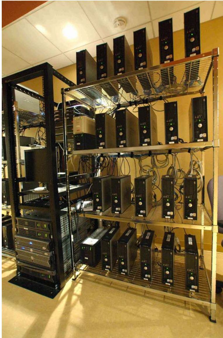
Figure 2. VLAB physical configuration.

2.) The left rack houses (top to bottom) network switches, KVM switches, shared I/O devices, SAN server, and SAN UPSs. The right rack houses half of the VLAB workstations and their UPSs. An identical workstation rack is out of frame to the left.