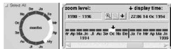
Figure 3 Examples of cyclical (left) and linear (right) temporal legends. The cyclical legend suggests a clock metaphor (with its repeating cycles) while the linear legend suggests an unending time line.

A primary focus of our exploratory geovisualization research is the development of methods for analyzing spatiotemporal data visually. Thus, change over time is a key issue in our work and it has been a research focus over the past decade (MacEachren and DiBiase, 1991; MacEachren, 1995; Harrower, et al, 1999). In several projects, we have directed specific attention to developing interface methods (grounded in logical metaphors) for posing temporal queries and for displaying and manipulating temporal aspects of a visual analysis (Edsall and Pequet, 1997; Edsall, et al., 1997). In particular, we have focused on design of interactors that support two complimentary conceptualizations of time, as linear and cyclic (figure 4).