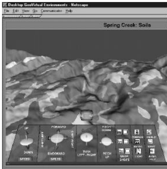
Figure 1 GeoVRML application in which display space represents geographic space iconically and color (in the original screen display) represents soil categories abstractly. See Fuhrmann and MacEachren, 1998 for more detail on the interface to this environment.

Important research questions here (beyond consideration of effective metaphors, discussed in more detail below) include determining the appropriate level of abstraction with which to depict visible and non-visible features within a spatially iconic GeoVE and investigating the impact of user manipulation of this abstraction level on understanding.