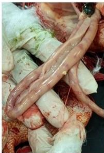
f: Hemorrhagic spots on duodenum