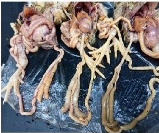
d: Intestinal lesions