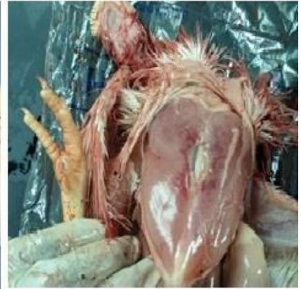
c: Breast muscle hemorrhage