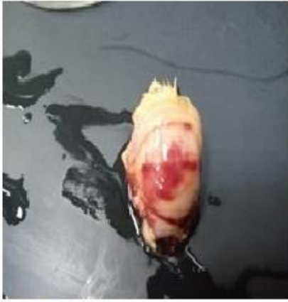
a: Skull hemorrhage