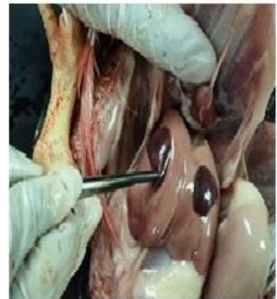
e: Liver button shape