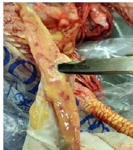
g: Catarrhal enteritis and hemorrhagic spots on duodenum

Clostridium perfringens from the duodenum was phenotypically characterized in infected chicks, accompanied by salmonella infection (Table 4).