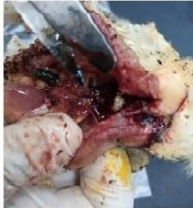
b: Clotted blood