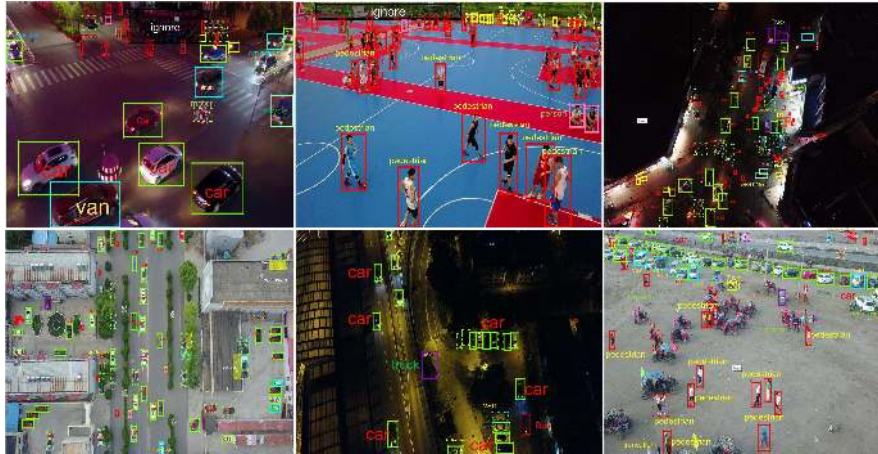
Fig. 3: Some annotated example images of the object detection in images task. The dashed bounding box indicates the object is occluded. Different bounding box colors indicate different classes of objects. For better visualization, we only display some attributes.

number of objects in each image in Fig. 2. The images of the three subsets are taken at different locations, but share similar environments and attributes.