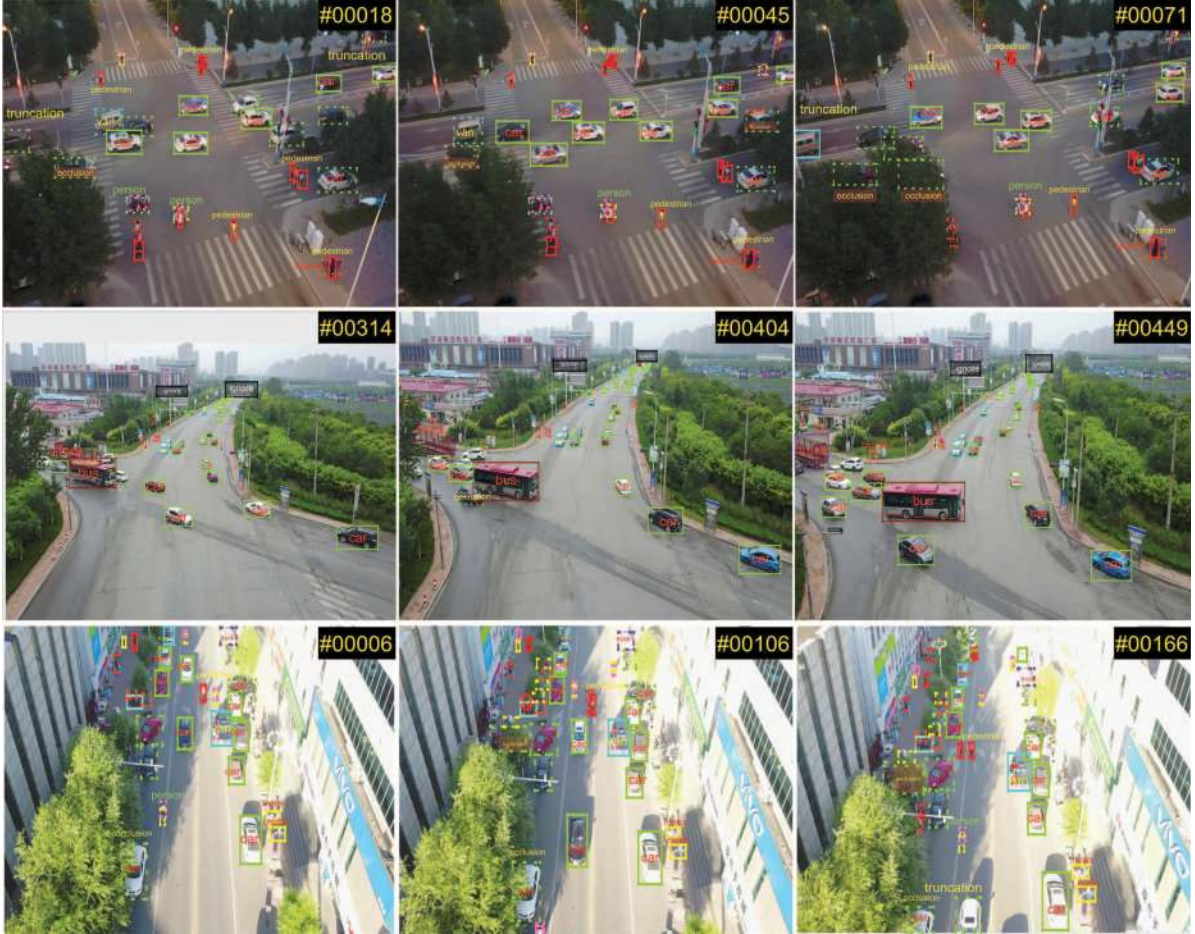
Figure 1. Some annotated example frames of video object detection. The bounding boxes and the corresponding attributes of objects are shown for each sequence.

DM2Det (A.6), FRCFPN (A.8), HRDet (A.10) and Sniper+ (A.12). Four detectors are variants of Cascade R-CNN [2], i.e. , DBAI-Det (A.4), DetKITSY (A.5), Libra-HBR (A.11) and VCL-CRCNN (A.13). Three detectors are based on anchor-free Cornet-Net [15], AFSRNet (A.1), CN-DhVaSa (A.2) and CornerNet-lite-FS (A.3). Besides, EODST++ (A.7) and FT (A.9) consider temporal coherency for more robustness. We present a brief description of the submitted algorithms in Appendix A. We also conduct 6 state-of-the-art detectors, including 4 image object detectors ( i.e. , FPN [18], CornerNet [15], CenterNet [39] and Faster R-CNN [27]) and 2 video object detectors ( i.e. , FGFA [43] and D&T [9]). In summary, we evaluate 19 detectors in total in this challenge.