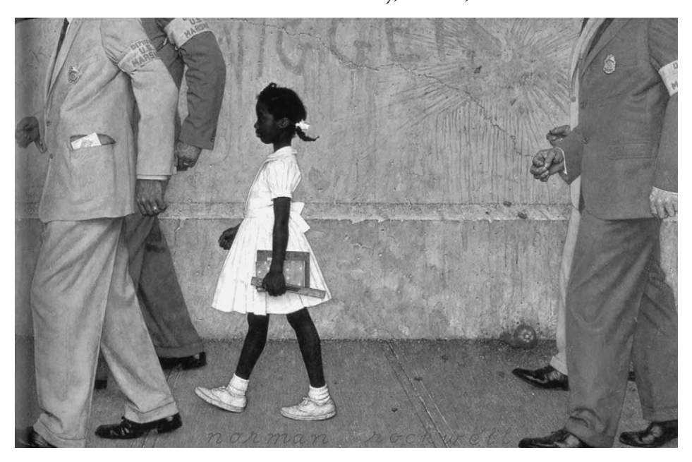
Figure 1. "The Problem We All Live With" (1964). Reproduced with permission.

In "Murder in Mississippi" (also known and labeled in Look as "Southern Justice"; Figure 2), from 1965, Rockwell rendered an incomplete oil sketch of the killing of Michael Schwerner, Andrew Goodman, and James Chaney, the young civil rights activists who had traveled to Philadelphia, Mississippi, in the summer of 1964 as part of a large contingent of volunteers determined to break the back of segregation—and in particular the state's intimidation of black voters. Originally, Rockwell submitted the sketch to Look's art director, who recommended it be published. Rockwell insisted that the director allow him to produce a finished painting, but he was told that everyone at the magazine preferred the sketch, the loose brushwork of which "delivered more impact than the finished oil." So the preliminary study was published.