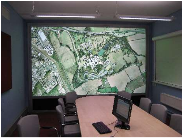
Fig. 2. 8k Auditorium at University of Essex

of reality and greater sense of presence compared to other existing digital media formats. The NML [6] is an interdisciplinary laboratory focused on research and development for the deployment of UHD media applications over high performance communication networks. It is one of the few network connected UHD facilities in the world and is equipped with visualisation facilities for emerging 4K 3D and 8K media formats. Within the VISIONAIR framework, the NML is providing advanced network technologies for application-aware delivery of future networked UHD applications (including UHD VR applications) and remote collaborations between researchers. In addition, it is providing access to its visualisation facilities as well as its extensive network infrastructure comprising connections to UK, European and International locations through 1 and 10 Gbps lightpath connectivity.