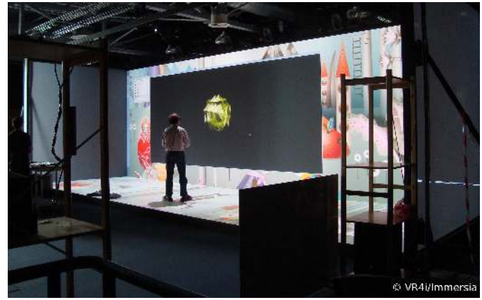
Fig. 3. One of the CAVEs at INRIA

The VR4i, Virtual Reality for Improved Innovative Immersive Interaction, team is located at Rennes together with IRISA. The main purpose of the VR4i team is to improve the interaction of users with and through virtual worlds. Our main research activity is concerned with real-time simulation of complex dynamic systems, and we investigate real-time interaction between users and these systems. We address mechanical simulation, control of dynamic systems, real-time simulation, haptic interaction, multimodal interaction,