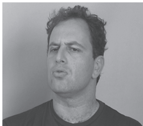
Figure 4 illustrates a typical wh-question: AU 4 (which draws the brows together and/or lowers them) occurs in 92% of the wh-questions in our corpus, and AU 5 (which raises the upper eyelids making the eyes look bigger) in 75%. As with yes/no questions, a forward head movement (AU 57) characterizes wh-questions (100%). 11

Typical wh-question intonation. “ Where is the book?”