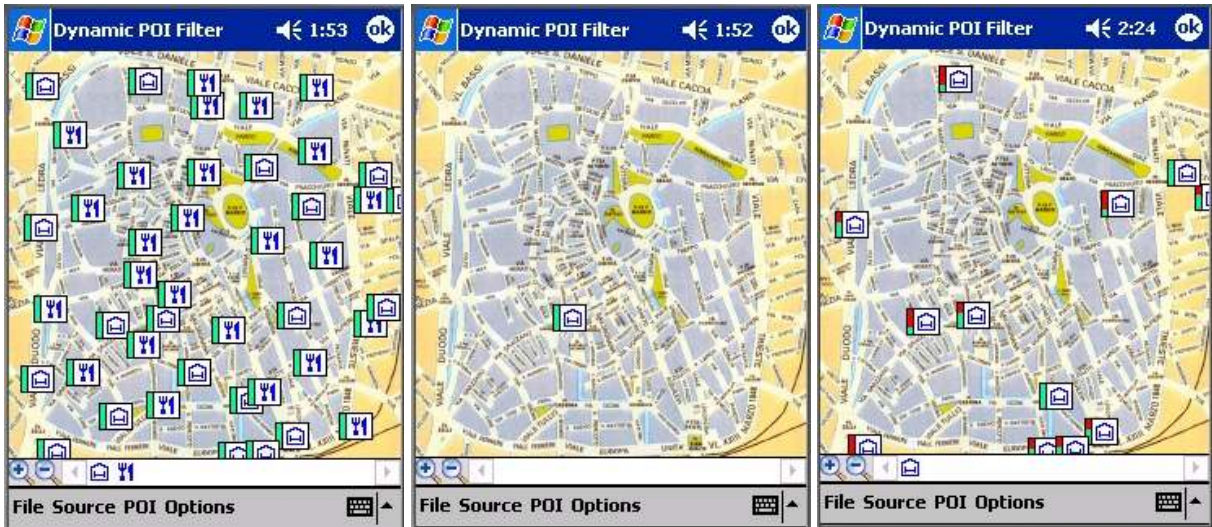
(a) (b) (c) Figure 1. Visualizing points of interest (POIs) on a map in a real mobile application.