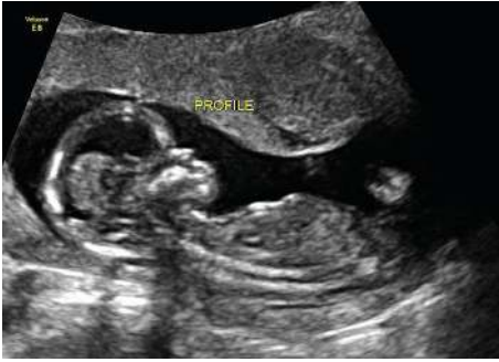
FIGURE 1: Profile at 14-week gestation shows prominent forehead and nasal hypoplasia.