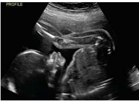
FIGURE 2: Anatomy assessment at 21-week gestation shows continued flat facial profile with nasal hypoplasia.

supplement containing vitamin K. During the admission, hypokalemia was corrected and she received daily injections of multivitamin, thiamine, and folate with her intravenous fluids.