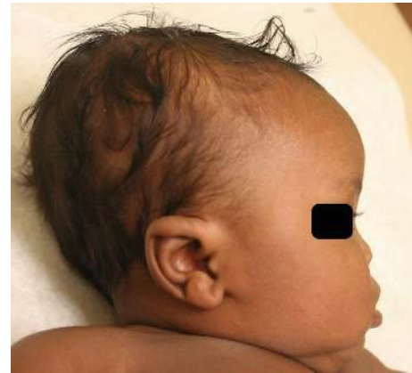
FIGURE 4: Facial profile 2 months after delivery shows nasal hypoplasia consistent with previous ultrasounds.