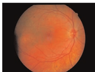
Figure 5: Fundus photograph showing leopard skin appearance after resolution of retinal detachment.