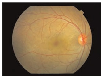
Figure 3: Fundus photograph showing serous retinal detachment involving macula.

kg/day initially and it was then gradually tapered. One patient also received pulse steroid therapy (Intravenous Methylprednisolone 1 g/day) for 3 days which was followed by oral steroid therapy. In addition, one of the patients also received cytotoxic therapy (cyclosporine). All the patients were followed for 12 – 94 months with a mean duration of 44 months. Vision threatening ocular complications included glaucoma, cataract and macular