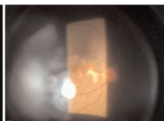
Figure 6: Fundus photograph showing sunset glow appearance.