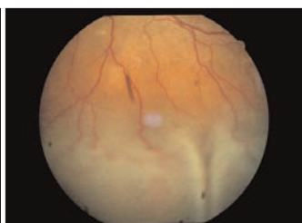
Figure 2: Fundus photograph showing serous retinal detachment involving inferior retina.