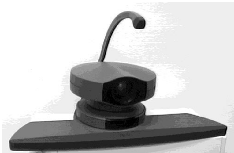
Figure 3: The PictureTel LimeLight TM , Dynamic Speech Locating Technology