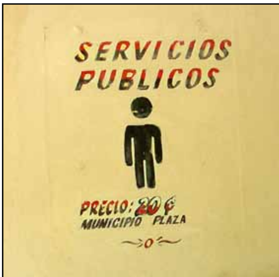
"Public services", sign at the entrance of the public toilet at the Quixote Park in Vedado.