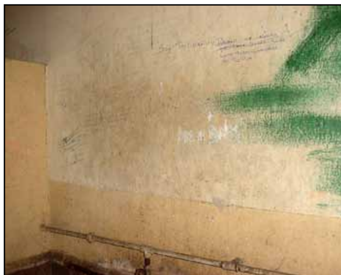
Men toilet at the Pío Pío.

The place had a little grimy window, no light and excreted a sickly, suffocating, sweet stench – a mix of sulphur, methane, semen, sweat and furtive, anonymous