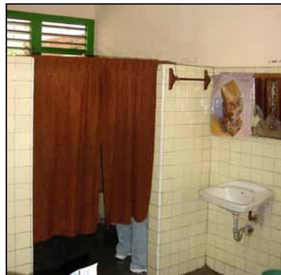
Public toilet at the Quixote Park.

Some offers and demands expressed in the graffiti point to men who respond to traditional canons of masculinity and who don't think of themselves as homo-