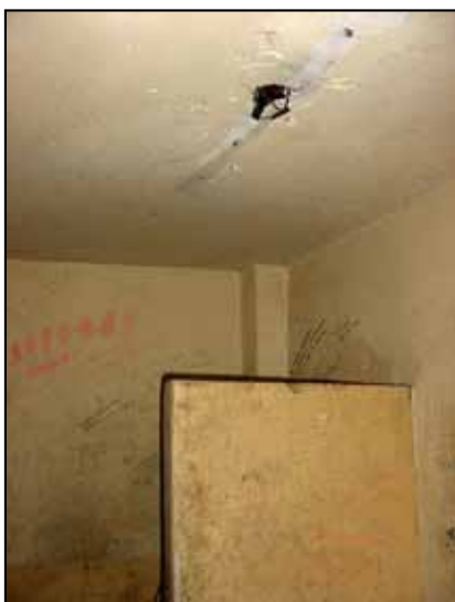
Men toilet at the Pío Pío.

As I rushed to the toilet, the brisk roaring voice of the old lady stopped me short to announce that it was occupied. After 15 minutes of restless pacing, the washroom sentinel realized my anxiety and in a fit of anger began belching out obscenities at the washroom patrons who, upon hearing her hollered threats to call the police, came out the door in a panicky stampede. The three individuals hastily walked passed me, heads down, but bearing in their eyes the fraternal complicity of a "secret" shared in the four walls of that washroom. I immediately decided to unravel the mystery, although it was a little too obvious to infer.