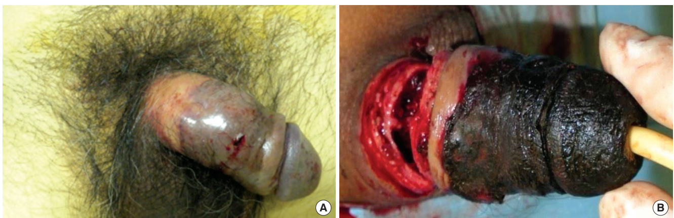
Fig. 2. Penile necrosis lesion of a patient receiving systemic anticoagulation with low molecular weight heparin and warfarin. Skin distal half penile shaft and glans penis showed black discoloration with erythema after penile blood clot extraction due to priapism (A). International normalized ratio (INR) at the time of appearance was 6.01 and the platelet count was 164 \times 10^9/L . Results showed that the patient had a deficiency of protein C and S, with an activity level of 16% and 20% of normal value. The patient had a known diagnosis metastatic lung adenocarcinoma. Seven days after the initial event, physical findings showed distal half penile necrosis including glans penis and we performed partial penectomy (B).