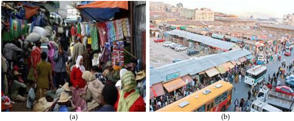
Figure 6. a. Merkato Open Air Market Stall; b. Addis Merkato Bus Terminus

The Merkato market covers several square kilometres and employs an estimated 13,000 people in 7100 business units. The open air market has over 120 stores and one massive shopping complex that houses 75 stores. The primary merchandise passing through Merkato comprises local agricultural produce – most notably coffee – cheap synthetic textile and electronic imports from countries in the Middle East and Far East.