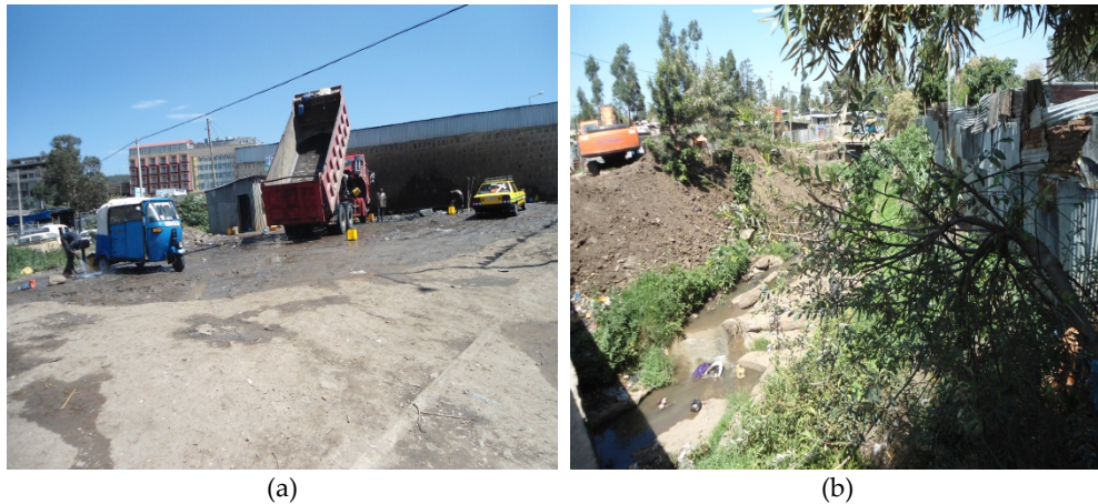
Figure 3. a. Car washing contaminating groundwater; a. Quarrying and structures encroaching stream bank