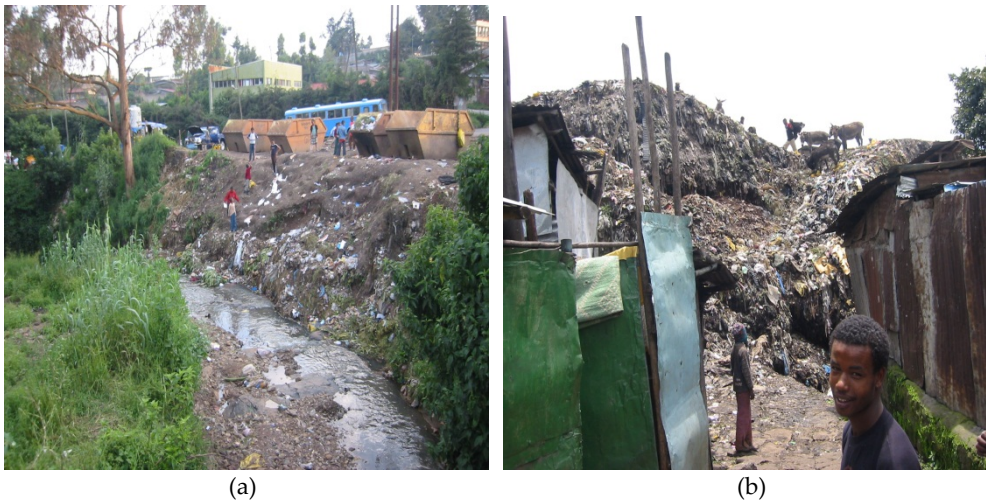
Figure 7. a. Garbage thrown into nearby stream; b. Scavenging and foraging on dump waste

Our focus group discussions with kebele waste management officials reflected that most households were reluctant to pay for the municipality services rendered for solid waste removal. This coincided with the common practice of residents dumping all range of solid waste materials on the river banks, open sewers in the surroundings of their living areas (Fig. 7 a and b.).