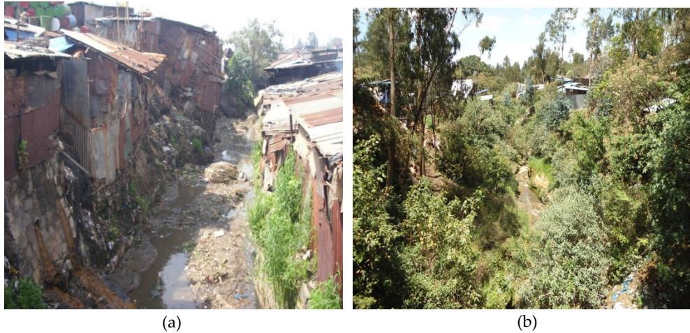
Figure 5. a. Slum housing in Addis Ababa; b. Unplanned settlements on stream banks

urban migration, increasing urban poverty and inequality, insecure tenure on property, political conflict, wrong policies and globalization [61].