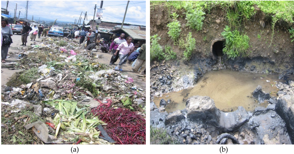
Figure 8. a. Refuse dumped on street pavement; b. Photograph 12: Industrial toxic waste water in a nearby stream

balance of 35% adds to the accumulating waste visible in the clogging or poisoning of riverine systems and the uncontrolled disposal of refuse on public open spaces (Fig. 8 a and b.).