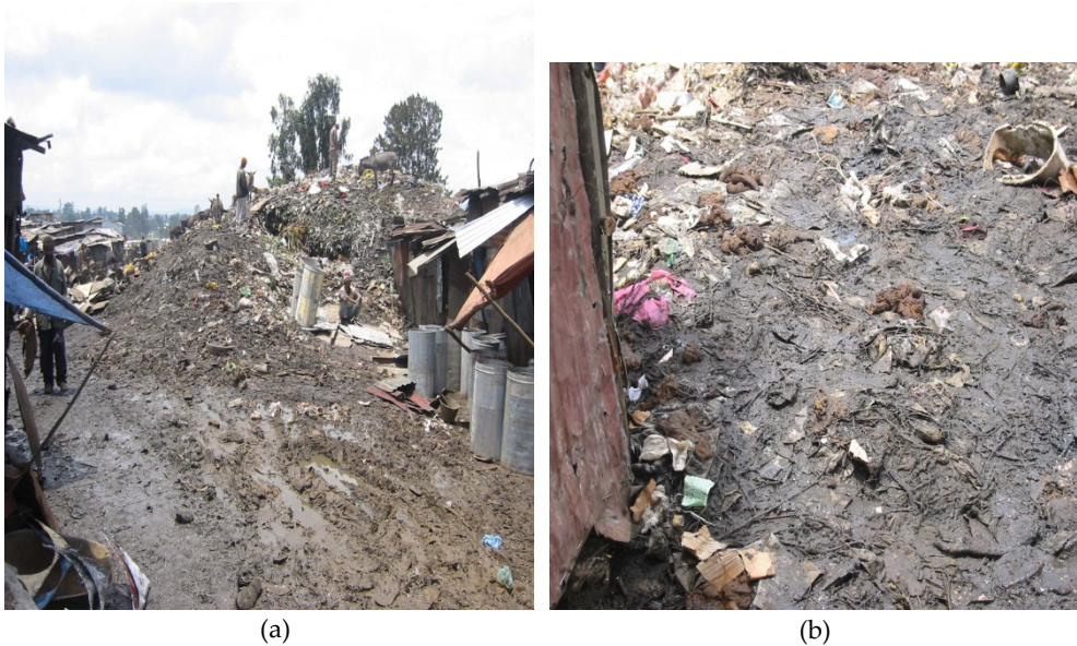
Figure 2. a. Waste dumping site in Merkato; b. Human excreta in home surroundings in Merkato

The management of waste in the urban centres of Ethiopia is the responsibility of the Municipal Division of Health. All municipalities – except the chartered cities of Addis Ababa and Dire Dawa who have cabinet representation – exercise some autonomy in managing their own affairs. All the chartered cities and the certified smaller urban centres are mandated “to provide, maintain and supervise environmental health services along with other activities in their own areas” [14]. However worthy these objectives sound, most of the municipalities and urban centres do not seem to have efficiently run environmental planning and management institutions let alone sufficient resources for discharging their responsibilities effectively. This scenario is worsened, in part, by the sustained low priority accorded to essential sanitation activities in most of the country’s urban centres largely attributing to insufficient local revenue bases. Besides their routine administrative duties, the sanitarians assigned to the regional health departments and environmental health centres can only afford attending to emergency cases especially water pipe outbursts and toilet flooding - considered imminent threat to the residents.