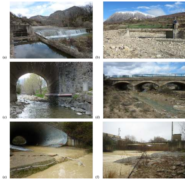
Figure 3. View of stream gauging stations ( a : Cabecera, b : Villacarli, c : Carrasquero, d : Ceguera, e : Lascuarre, f : Capella).

served after heavy floods. The times of these changes have been reconstructed manually; the respective difference to the effective flow level has been added as offset information in the database. Thus, both the absolute water level h_{\text{abs}} and the effective water level h_{\text{eff}} can be retrieved with