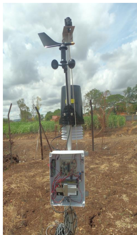
Figure 5.1 Experimental setup at field