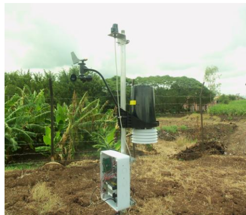
Figure 3.1 Integrate sensor suite at field

The Integrated Sensor Suite (ISS) collects outside weather data and sends the data to a Weather control station. The standard version of the ISS contains a rain collector, temperature sensor, humidity sensor and anemometer. In addition to the standard weather features, the ISS Plus adds a pre-installed solar radiation sensor and an ultra-violet (UV) radiation sensor. Temperature and humidity sensors are mounted in a passive radiation shield to minimize the impact of solar radiation on sensor readings. The anemometer measures wind speed and direction and can be installed adjacent to the ISS or apart from it. On an ISS Plus, the additional solar and UV sensors are mounted next to the rain