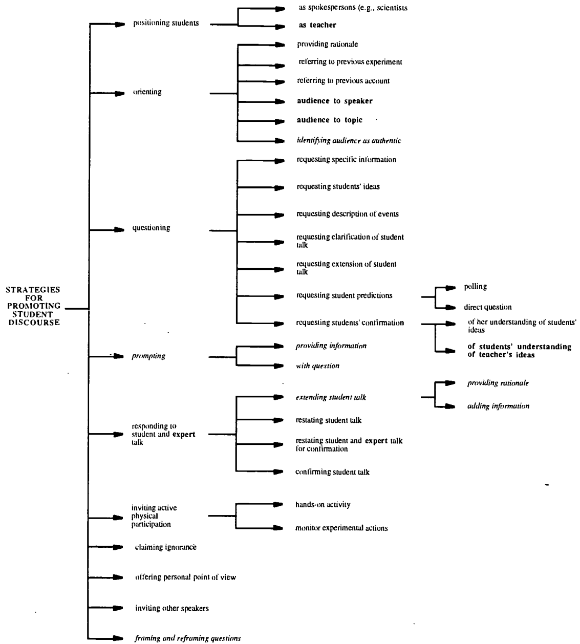
Figure 6. Taxonomy of the discourse strategies used by the teacher to promote students "talking science."