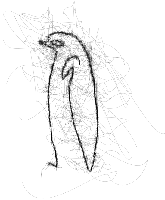
Fig. 3 A sketch produced by the swarms without SDS exploration.