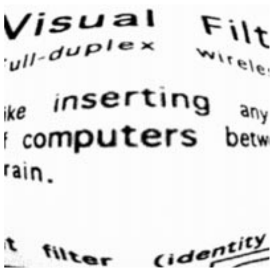
Figure 5. Using a visual filter such as this in the personal visual assistant may help a person with very poor vision to read. The central portion of the visual field is hyperfoveated for a high degree of magnification while allowing good peripheral vision.

We've all been lost at one time or another. Perhaps, at the end of a long day in a new city or a large shop-