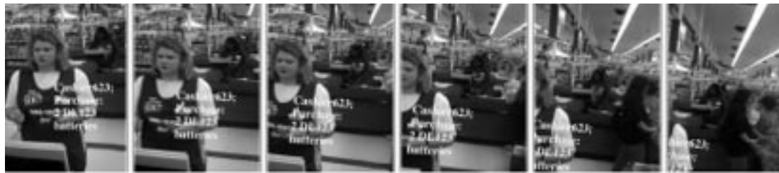
Figure 4. Six frames of low-resolution video from a processed image sequence. My computer recognizes the cashier and superimposes a previously entered shopping list on her image. When I turn my head to the right, the list moves to the left on my screen, following the flow-field of the video imagery coming from my camera. Note that the tracking (initially triggered by automatic face recognition) continues even when the cashier's face is completely outside my visual field, because the tracking is sustained by other objects in the room. Thus, the list of items I have purchased from this cashier appears to be attached to her. This functionality can provide a clear recollection of facts during a refund transaction.

ple-and-hold technique let me see the unseeable: writing on moving automobile tires and the blades on a spinning airplane propeller. Depending on the sampling rate of my apparatus, the blades would appear to rotate slowly backward or forward, much as objects do under Harold Edgerton's stroboscopic lights. 6