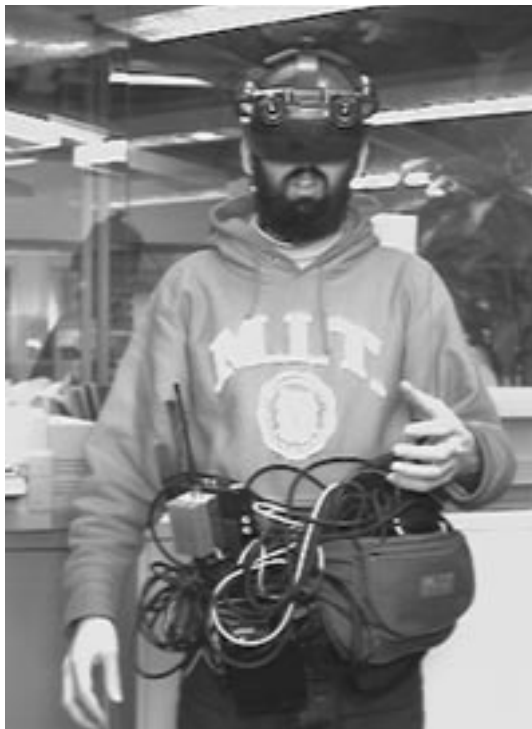
Figure 6. My early 1990s apparatus for wearable, tetherless, computer-mediated reality included a color stereo head-mounted display with two cameras. The intercamera distance and field of view approximately matched my interocular distance and field of view with the apparatus removed. Communications equipment was worn around the waist. Antennas, transmitter, and so forth, were at the back of the head-mount to balance the weight of the cameras in front.

With enough light present, images can be incorporated into the note-taking process in a natural manner, without distracting the other person. Even in low light—for example, while talking with someone out-