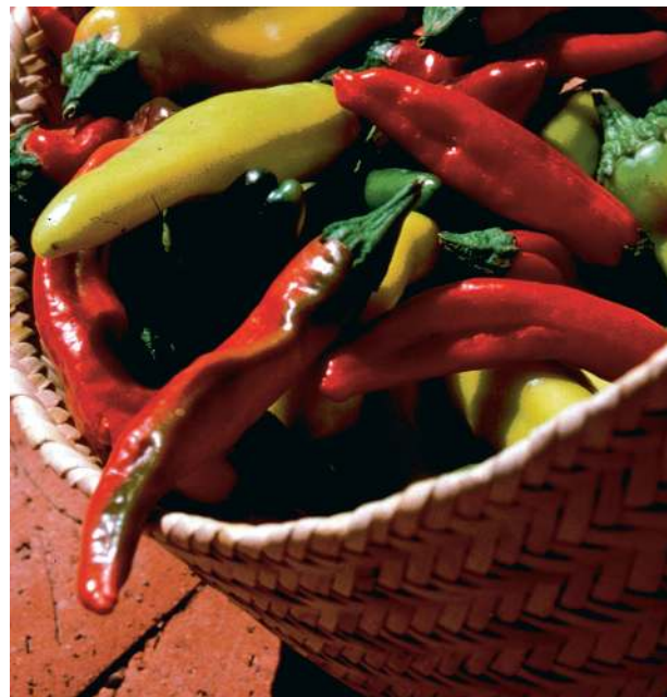
Some of 60 different chili varieties richly diverse in color, shape, size, and heat grown at the Conservation Farm in Patagonia, Arizona.