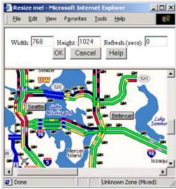
Figure 5: Customizing embedded content. The user can change the cropping window on the distal page by simply resizing and scrolling the browser window.

the user can control how often each clipping reloads itself in the browser window by setting the period, in seconds; zero seconds disables auto-refreshing. By default, MONTAGE sets this value to zero (refreshing disabled), although MONTAGE could suggest a refresh interval based on the user’s past revisit frequency to each page.