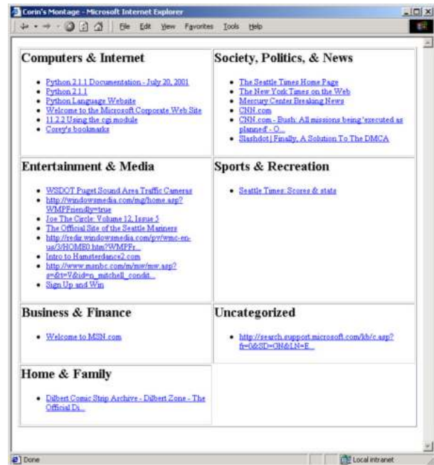
Figure 3: A links-only montage.

heuristics to identify when one session ends and when the next session begins. Section 4 provides the exact details on how we clean and segment the data into sessions.