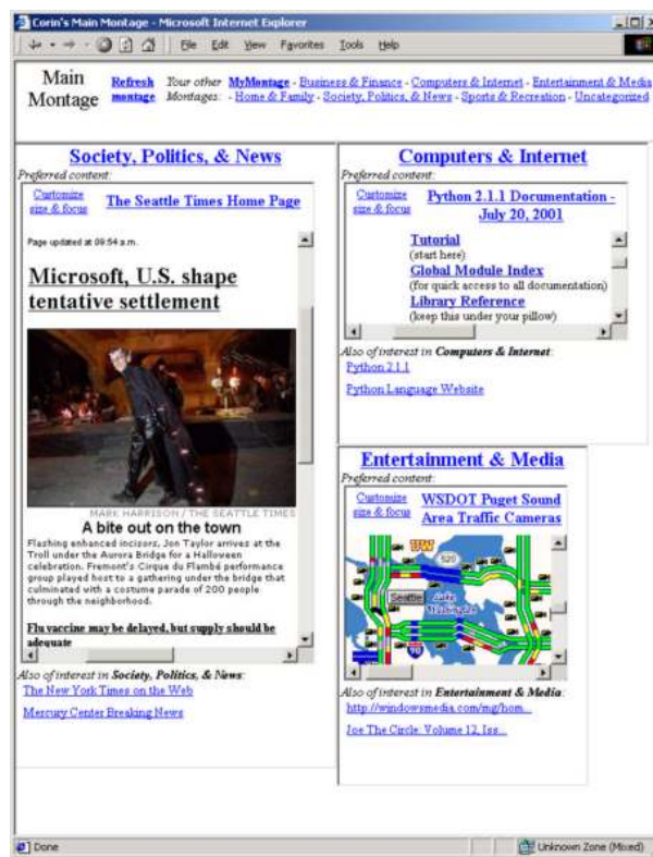
Figure 1: Main montage. Content is grouped by topic, and each topic heading links to a topic-specific montage.

Our intuition strongly suggests that routine browsing is a common mode for interacting with the web; our informal surveys early in our study suggested that many people tend to view the same page or constellation of pages when in similar contexts. The more important questions that must be answered are whether we can formulate good notions of context, identify the routine browsing associated with each context, and leverage this information to assist the user. These questions are embodied in the hypotheses we posed in the introduction and are answered with our experiments with the MONTAGE system.