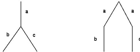
Figure 2: Processes Equivalences; a is a ticket purchase, b ticket use for the match, c a ticket change.

concurrently are simulated by another group of process running concurrently if all their behaviors are contained in the behaviors of the other. It is known that simulation implies containment. As example let us discuss Figure 2.