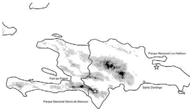
Figure. Hispaniola in the West Indies, on which are located Haiti (western third of the island) and the Dominican Republic. West Nile virus transmission occurred at Parque Nacional Los Haitises before November 2002. Shades of gray are 500-m intervals (e.g., 0–500, 500–1000).

Serum samples were screened for flavivirus-neutralizing antibodies by plaque-reduction neutralization test (PRNT) according to standard methods (11) and by using challenge inocula of 100 plaque-forming units (PFU) WNV strain NY99-4132 and Saint Louis encephalitis virus (SLEV) strain TBH-28. Testing for neutralizing antibody