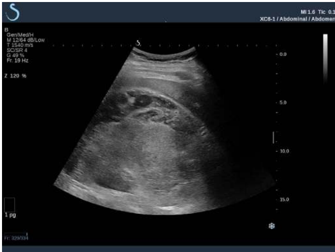
Fig. 6. Transabdominal ultrasound of a huge hyperechoic mass of the right adrenal gland. This finding is typical for the rare diagnosis of adrenal angiomyolipoma.