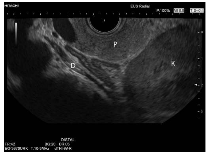
Fig. 2. Endoscopic ultrasound image of the left adrenal gland, showing the body and two wings, as well as the normal layering of the gland as described in Fig. 1. The anatomical landmarks are the pancreatic body and tail (P), upper pole of the left kidney (K), and the left diaphragm (D).

The prevalence of AIs of any size with imaging is reported to be about 5%, ranging from 1% to 12% (with higher rates in older age groups) and the frequency of AIs has approached 8.7% in