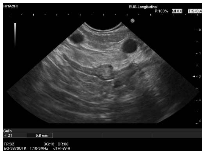
Fig. 4. Very small lesion (6 mm, between markers) of the body of the left adrenal gland, which was found incidentally on endoscopic ultrasonography performed for suspected common bile duct stones. The lesion was not found with computed tomography, and an endocrine work-up did not show any endocrine activity.

autopsy series [13,14]. In patients with a high body mass index, diabetes mellitus, and arterial hypertension, the prevalence is even higher [15,16]. Bilateral AIs are found in about 10%–15% of cases [17–19]. In unselected healthy subjects and in patients with inflammatory bowel disease, a prevalence of 5% was reported using abdominal US [8,20–22]. By far the largest data sets have been collected using CT. With state-of-the-art contemporary CT examinations, AI was found in 4.4%–5% of individuals [23–25]. In older studies, the reported prevalence was much lower for both methods, with AIs found in 259 of 61,054 individuals (0.4%) using CT scans performed from 1985 to 1990 [26], and rates of 0.1% [27] or less [28] using abdominal US. Therefore, AI was described to be "a 'disease' of modern imaging technology" [29]. The main role of imaging is therefore to limit the invasive management of AI, and particularly the number of surgical adrenalectomies and biopsies.