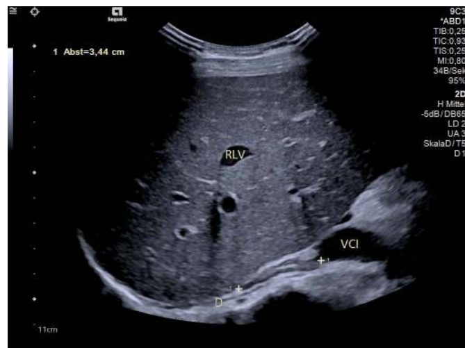
Fig. 1. Transabdominal ultrasound image of the right adrenal gland (between markers, 34.4 mm length). The anatomical landmarks are the right liver lobe (RLV, right liver vein), the right diaphragm (D), and the inferior caval vein (vena cava inferior [VCI]). Layering of the adrenal gland with a hyperechoic central echo representing the medulla, the hypoechoic cortex and hyperechoic capsule are depicted. The thickness of the adrenal gland is less than 7 mm (in this case: 5 mm).

After detection of an AI, there are a few important questions to be answered to determine the need for treatment: (1) What is the prevalence?; (2) Is the AI malignant?; (3) Does the AI have endocrine activity?