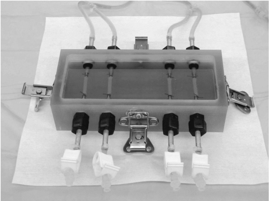
Figure 3. Photograph of a bioreactor as it is known in tissue-engineering laboratory, Lab A. This bioreactor is used to distend artificial blood vessel constructs to stimulate and research the cells that are cultured on the outside of prepared silicon sleeves. The sleeves with constructs are sutured onto mandrils inside the bioreactor's reservoir. The reservoir is filled with red culturing medium, as is the inside of the sleeves. The medium is forced into the sleeves by a pump to create well-calibrated pulsatile distension.

that is continuously evolving if only in minor ways. Thus, parallelism in this case should be read as a historical process ( situated ), not the least because these model systems are not fast-lived set-ups but sites of serious investment over considerable time spans, typically by a number or generations of lab members.