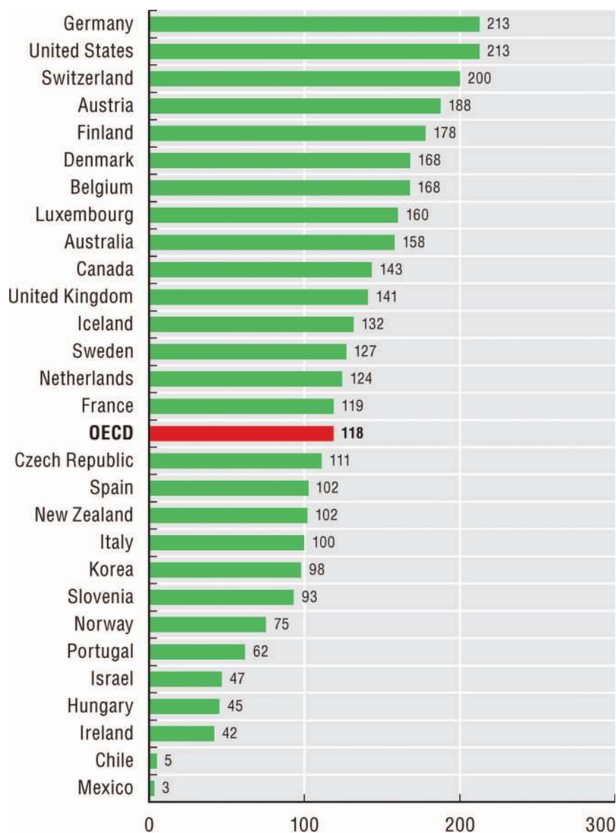
Figure 2 Knee replacement surgery per 100 000 population in 2009 (or nearest year). Source: Health at a Glance. OECD 2011 (available at http://dx.doi.org/10.1787/888932524773 ). 69 OECD, Organisation for Economic Cooperation and Development includes 34 member countries (Australia, Austria, Belgium, Canada, Chile, Czech Republic, Denmark, Estonia, Finland, France, Germany, Greece, Hungary, Iceland, Ireland, Israel, Italy, Japan, Korea, Luxembourg, Mexico, The Netherlands, New Zealand, Norway, Poland, Portugal, Slovak Republic, Slovenia, Spain, Sweden, Switzerland, Turkey, UK, USA).

perhaps most importantly, there is no consensus on the precise definition of joint failure, which refers to the loss of joint function (as assessed by various functional measurement tools), which is consequent on the multiple tissue pathologies that comprise the osteoarthritis process: cartilage loss, subchondral bone reaction, synovial inflammation, meniscal and ligamentous damage.