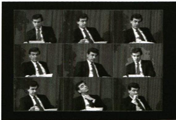
Figure 3 Graphic from insider trading case associating defendant's exercise of his Fifth Amendment privilege against compelled self-incrimination with a popular TV game show.

Lawyers, as rhetoricians, have always known that effective persuasion requires speaking in terms their audiences understand. And they are now adapting to a culture in which audiences are accustomed by their everyday work and leisure experiences with television, movies, print media, and computers to rely on visual—as well as audio and print-based—information. Adding to their traditional