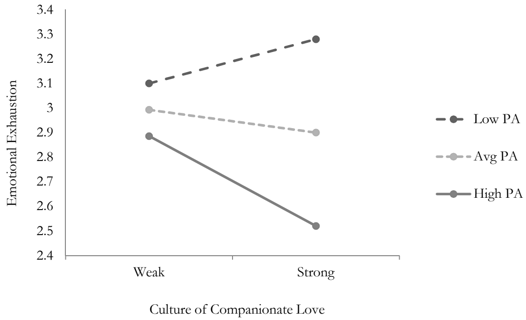
Figure 2: Interaction of a culture of companionate love and trait positive affect (PA) on employee emotional exhaustion.