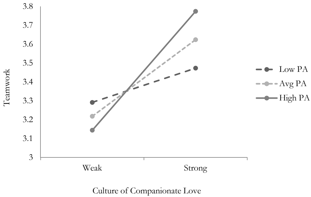
Figure 3: Interaction of a culture of companionate love and trait positive affect on employee teamwork.