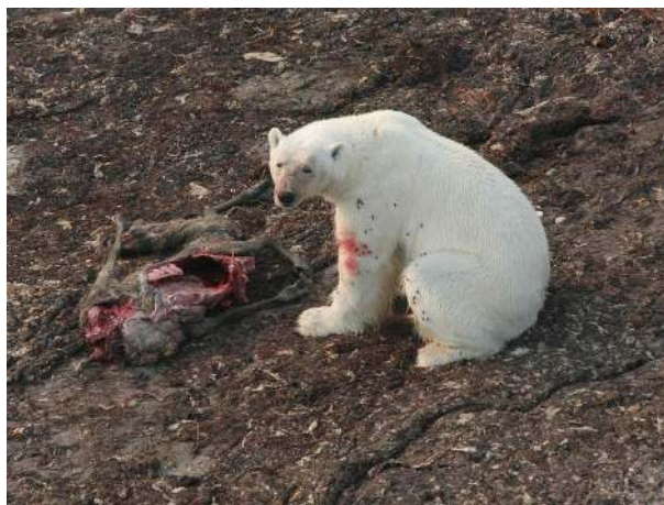
Figure 3. A polar bear looks up from the recently killed caribou it was eating at Keyask Island (58.16958°N 92.85194°W) on July 26, 2010.

(Hanson et al. 1972; Kerbes et al. 2006; Alisauskas et al. 2011), with highest increase and geographic expansion being on the Cape Churchill Peninsula (Rockwell et al. 2009).