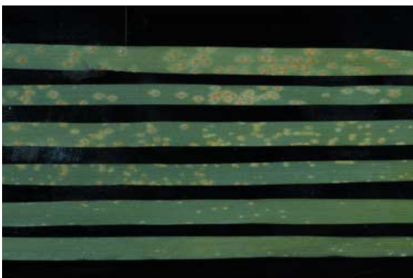
Fig. 3 Leaf rust seedling infection types. The lower leaves have resistant infection types that range from hypersensitive flecks to small–moderate size uredinia surrounded by chlorosis and necrosis. The infection type of the top leaf is fully susceptible with large uredinia without surrounding chlorosis or necrosis in the leaf tissue.

Most leaf rust resistance genes condition effective resistance to specific races of P. triticina . Race-specific resistance is usually manifested by a hypersensitive response (HR) of rapid cell death that occurs at the interface between fungal haustoria and host cells in the epidermal and mesophyll layers. Different resistance genes condition characteristic resistance phenotypes or infection types (Fig. 3). For instance, the resistance response of wheat lines with Lr3 is characterized by clearly defined hypersensitive flecks while lines with Lr2a have only very light flecks that are difficult to see. Other race-specific resistance responses such as those conditioned by wheat lines with Lr3ka , Lr3bg and Lr11 are manifested by small uredinia surrounded by chlorosis, and lines with Lr16 have small uredinia surrounded by necrosis. Resistance conditioned by these last genes is probably expressed at a later point in the infection and colonization process of P. triticina . Race-specific Lr genes are effective in seedling plants and remain effective in the adult plant stage. However, the resistance