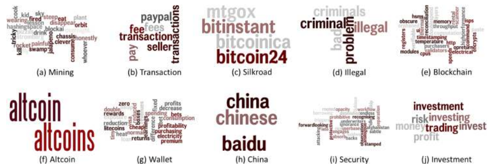
Fig 3. Ten topics generated by the Bitcoin forum documents.

Fig 3 shows the concept derived from the concept building phase and the words constituting the concept. We focused on a general phenomenal analysis of the meanings of the concept, rather than analysing all the words constituting the concept.