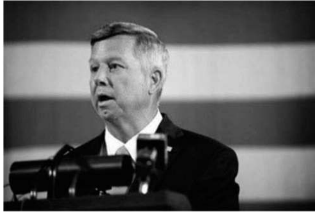
Figure 1. Governor Dave Heineman. From Text 3; caption: Gov. Dave Heineman