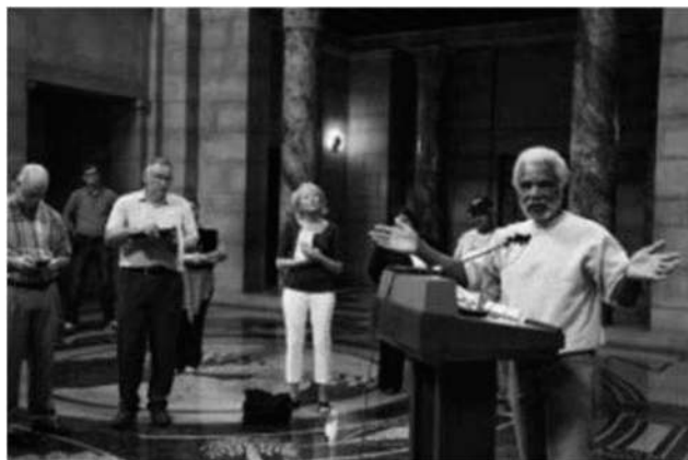
Figure 3. Senator Ernie Chambers. Text 8, caption: Sen. Ernie Chambers was among the activists and state representatives who gathered at the Capitol Friday to speak about the undocumented children who are coming into the United States from Central America.