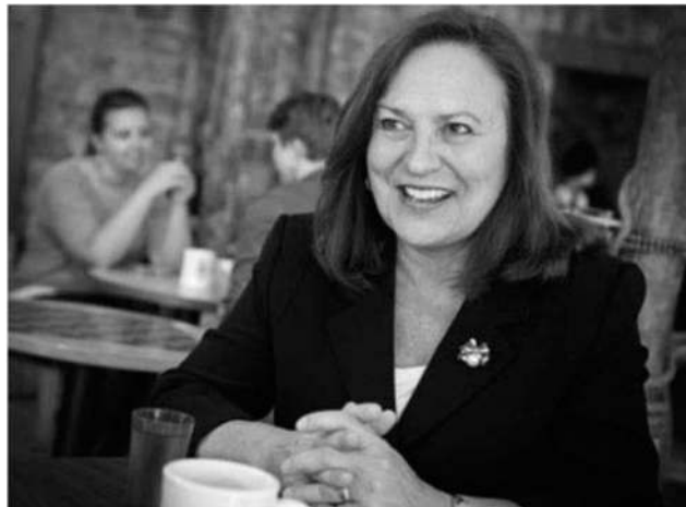
Figure 2. Senator Deb Fischer. Text 4, caption: U.S. Sen. Deb Fischer sat down for coffee 8 August 2013, at the Mill in the Haymarket