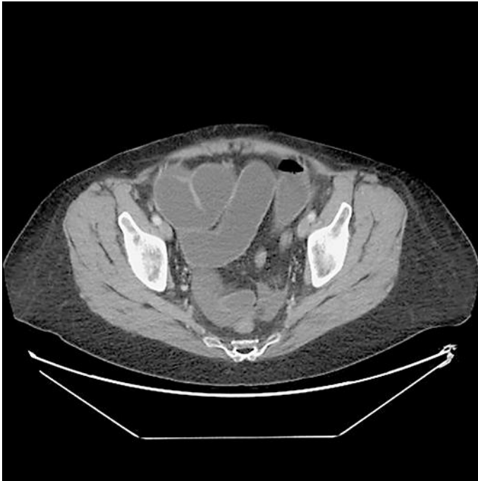
Fig. 3. Abdominal/pelvic CT of small bowel obstruction with transition point.