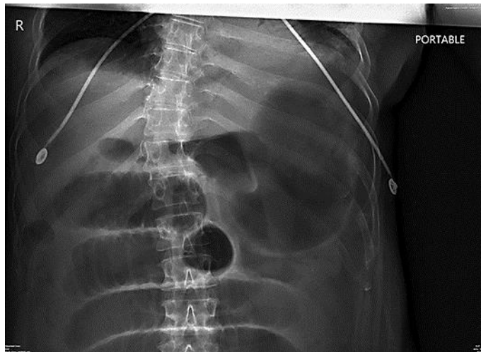
Fig. 2. Abdominal X-ray demonstrating obstruction.