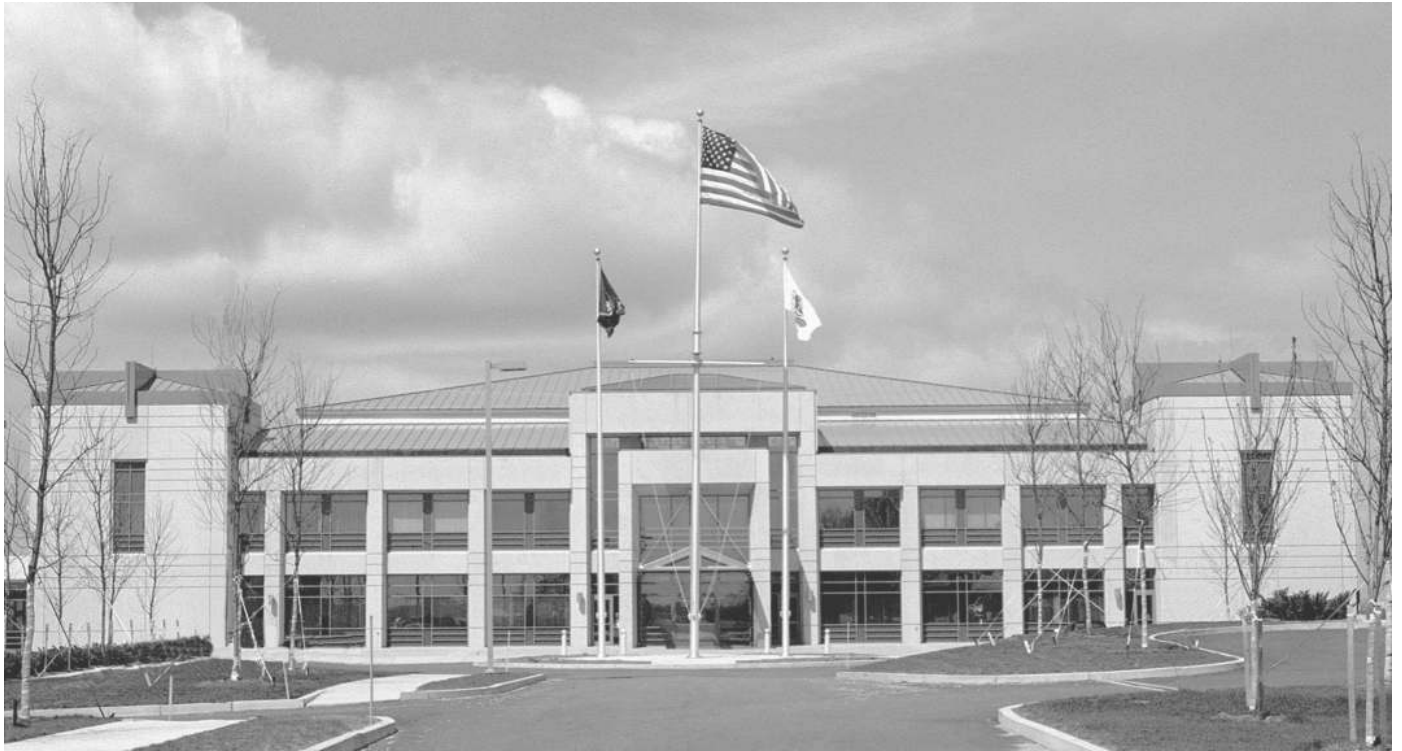
McCarty Little Hall