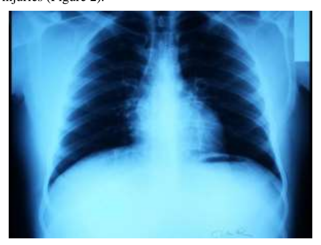
Figure 2 . Cardio-pulmonary radiography, posteroanterior view: heart in normal limits, without pleuro-pulmonary or thoracic wall lesions.

Cardiopulmonary radiography showed a heart within normal limits, without pleuro-pulmonary or chest wall injuries (Figure 2).