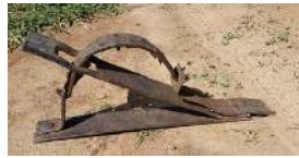
Figure 1: Snare poaching

Example 1. Consider a ranger protecting a large area with rhinos. The area is divided into two subareas N_1 and N_2 of the same importance. The ranger chooses a subarea to guard every day and she can stop any snaring by poachers in the guarded area. The ranger has been using a uniform random strategy throughout last year. So for this January, she can choose to continue using the uniform strategy throughout the month, catching 50% of the snares. But now assume that the poachers change their strategy every two weeks based on the most recently observed ranger strategy. In this case, the ranger can catch 75% of the snares by always protecting N_1 in the first two weeks of January, and then switching to always protecting N_2 : At the beginning of January, the poachers are indifferent between the two subareas due to their observation from last year. Thus, 50% of the snares will be placed in N_1 and the ranger can catch these snares in the first half of January by only protecting N_1 . But after observing the change in ranger strategy, the poachers will switch to only putting the snares in N_2 . The poachers’ behavior change can be expected by the ranger and the ranger can catch 100% of the snares by only protecting N_2 starting from mid-January. (Of course the poachers must then be expected to adapt further).