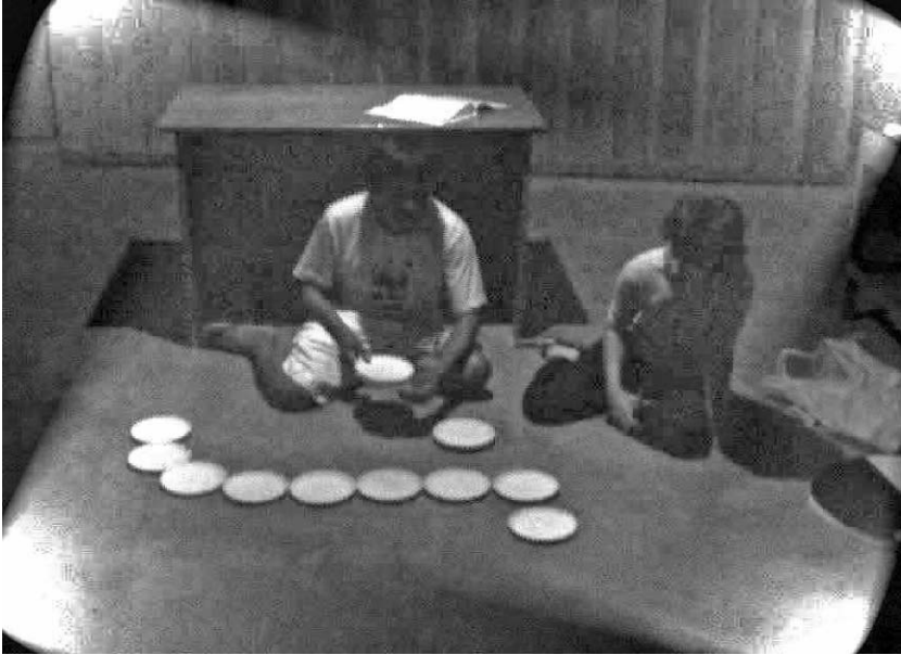
Figure 1. One participant's representation of the Amondawa year.

three intervals corresponding to the beginning, middle (or “high”) and end parts of the season. Table 2 lists the Amondawa bi-seasonal lexical system.